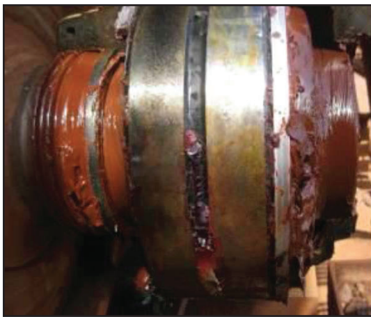
Contaminated red grease has gone through the bearing on the right side.